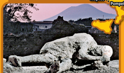
Illustration: Michael R. Pittman; Photo: Getty Images; Photo: Getty Images; Photo: Getty Images