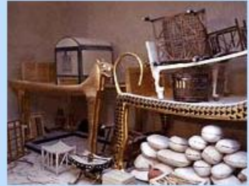
Some of the objects Tutankhamen wished to use in the afterworld