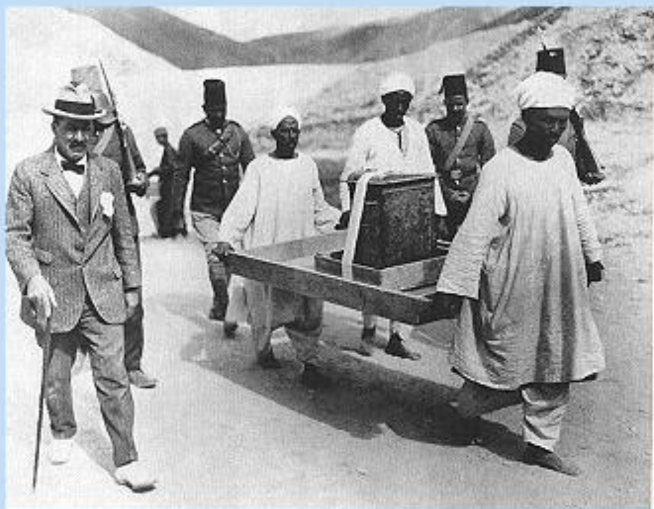
Howard Carter escorting artifacts from Tut's tomb. 1923