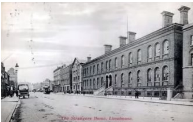
The Strangers' Home, West India Dock, c. 1900