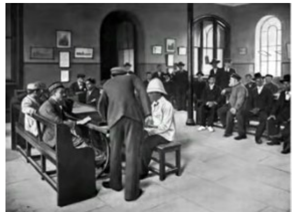
In the Main Hall of the Strangers' Home, West India Dock, c. 1902