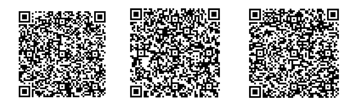
Set 3 Additional sounds (ue, ie, au, e-e)